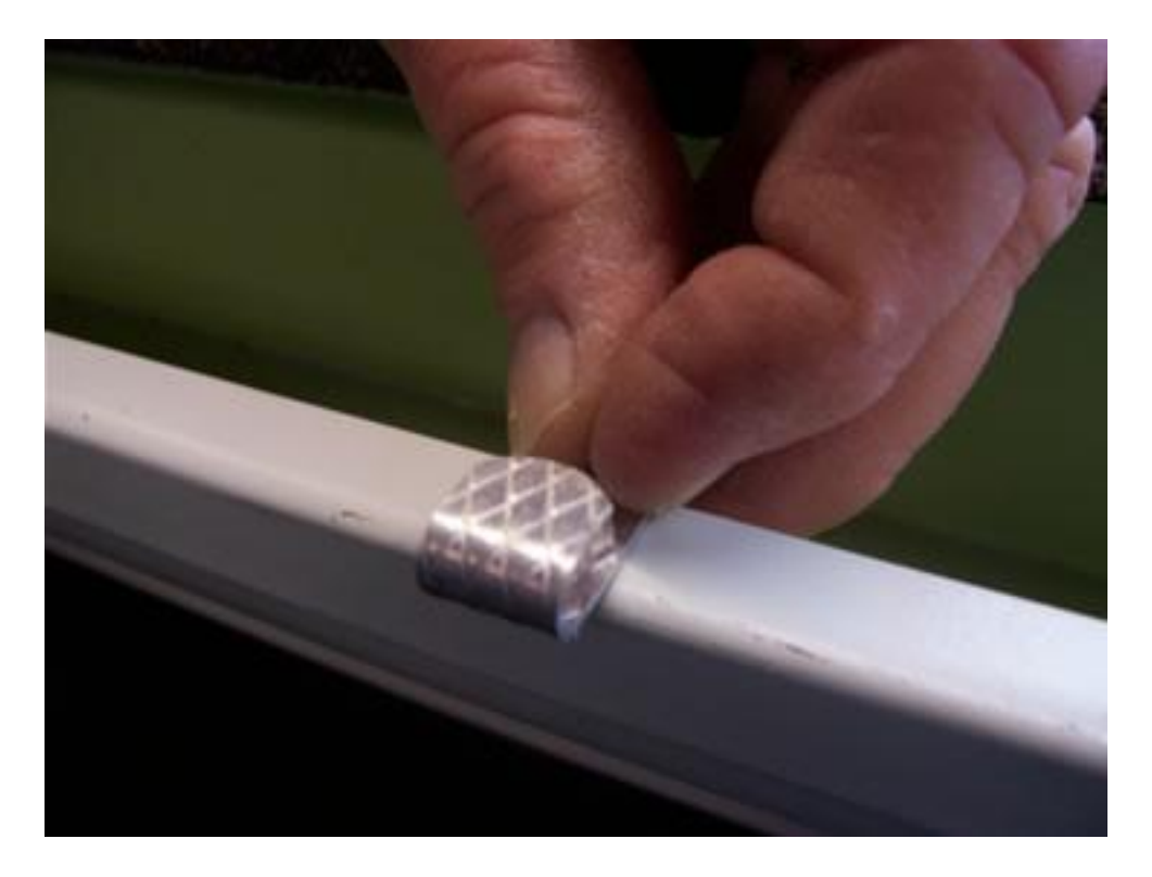
Pinch with thumb and index finger to permanently lock in place