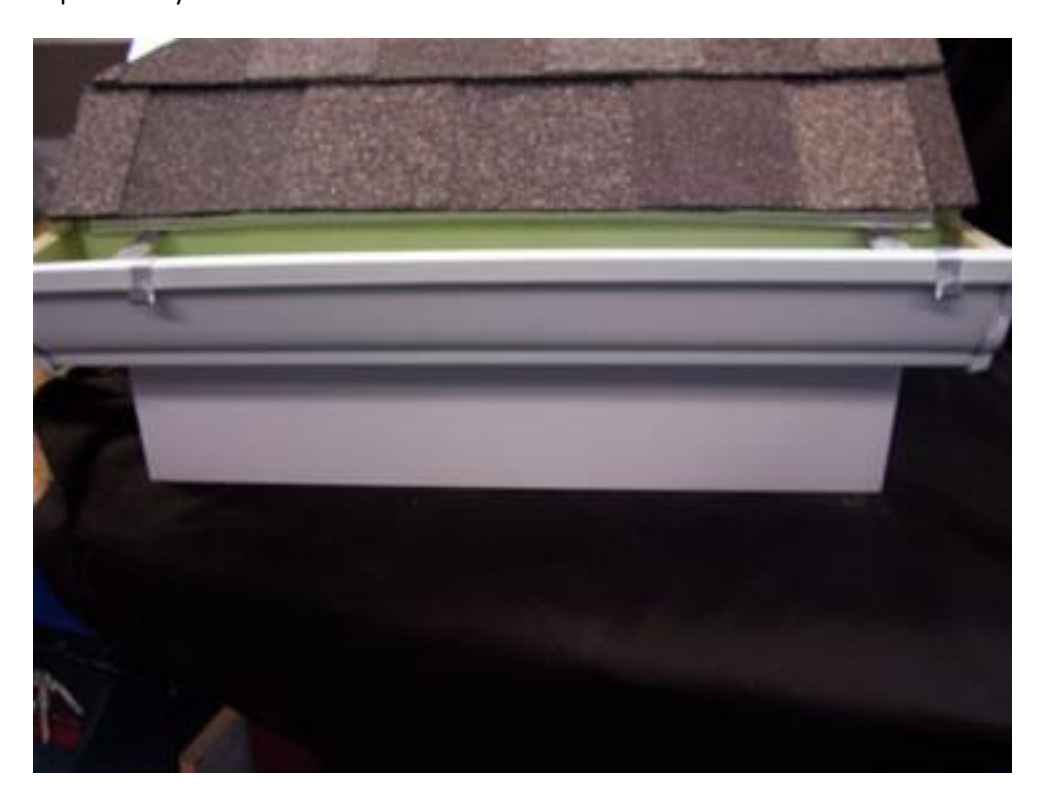
Your gutter hook will hold plants up to 20 pounds