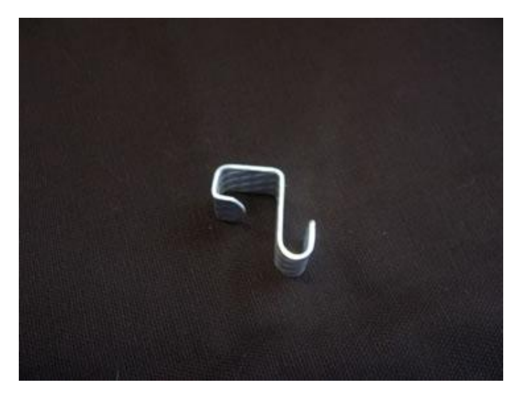
Place hook at back of gutter lip